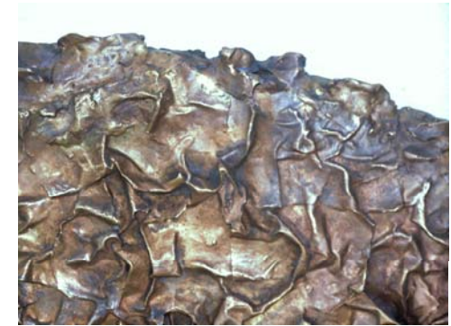
Meteor II, Bronze (Detail)