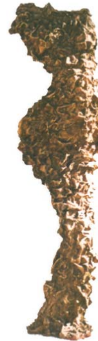
Frau 248, Bronze

phone/fax: ++49 8021 - 7429 atelier@fitzarte.de www.fitzarte.de