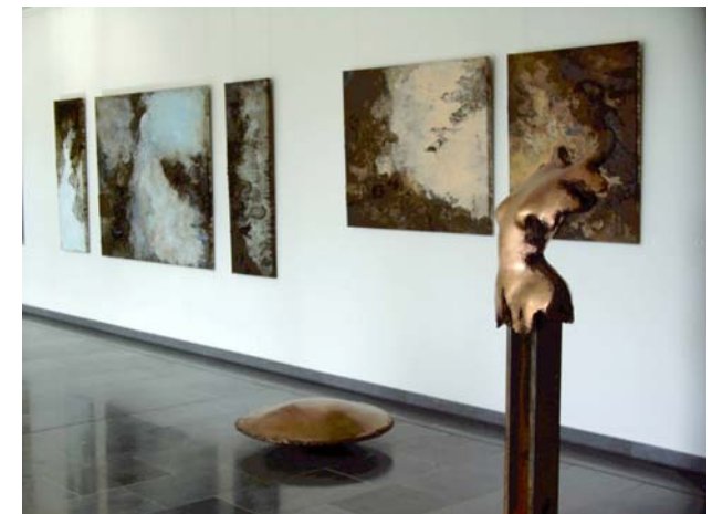
Bundespatentgericht München 2005